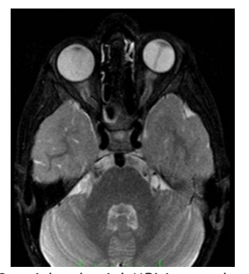
Figure 2. T2-weighted axial MRI image showed a linear hypointense band extending from the posterior surface of the lens capsule to the optic disc in the left eye.

The disorder is one of the most common congenital malformation syndromes of the eye and is usually unilat-